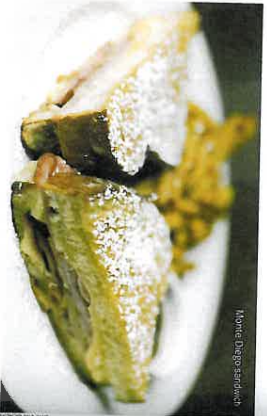
Monte Diego sandwich

Friday and Saturday, the kitchen serves till 11 p.m., with the bar open until midnight.