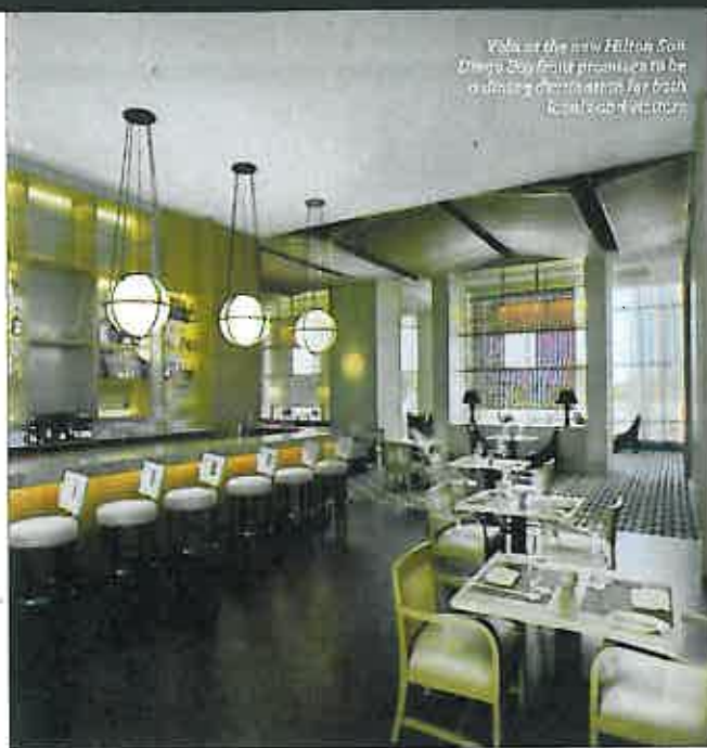
Visit the new Hilton San Diego Bayfront restaurant to be a dining destination for SD's local's and visitors.

2230 Shelter Island Drive, Shelter Island | 619.222.1181 www.balihairrestaurant.com